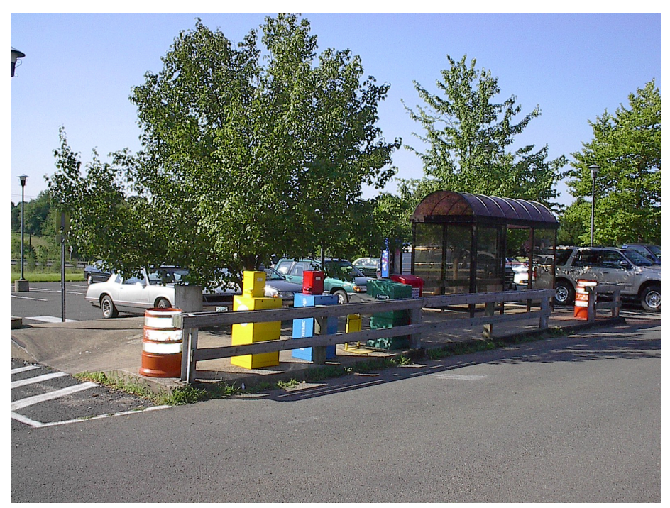
Southwest through Park and Ride Lot at Entrance on Route 605

View – South toward middle of Park and Ride Lot - Available Amenities