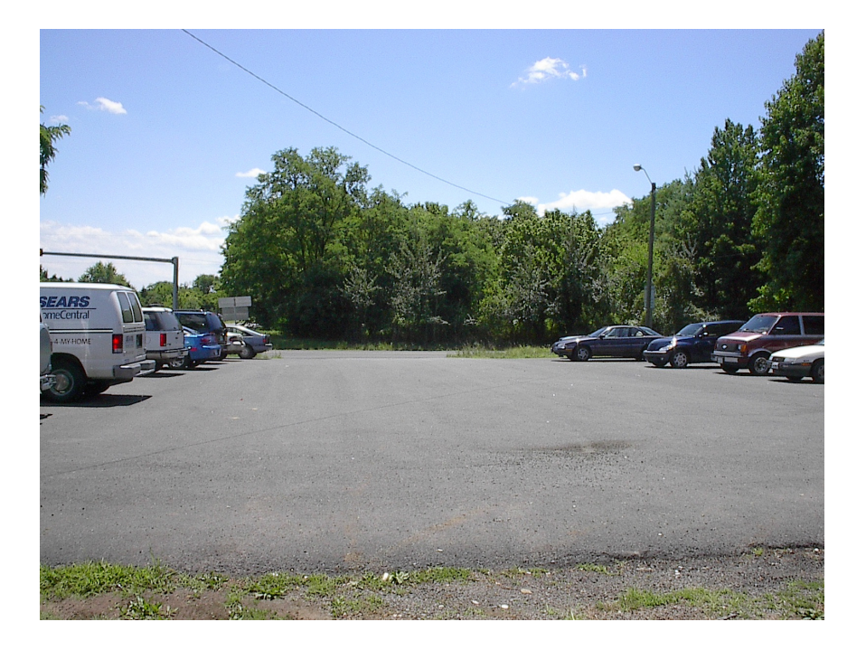
View - North through Park and Ride Lot from Entrance on Route 651

View – South through Park and Ride Lot toward Entrance on Route 651