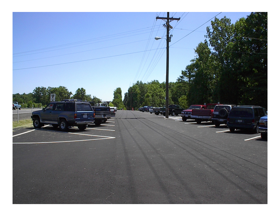
View - East Through Park and Ride Lot, Route 211 (Eastbound) Parallels Lot to Left

View – Southeast from Route 211 through Park and Ride Lot