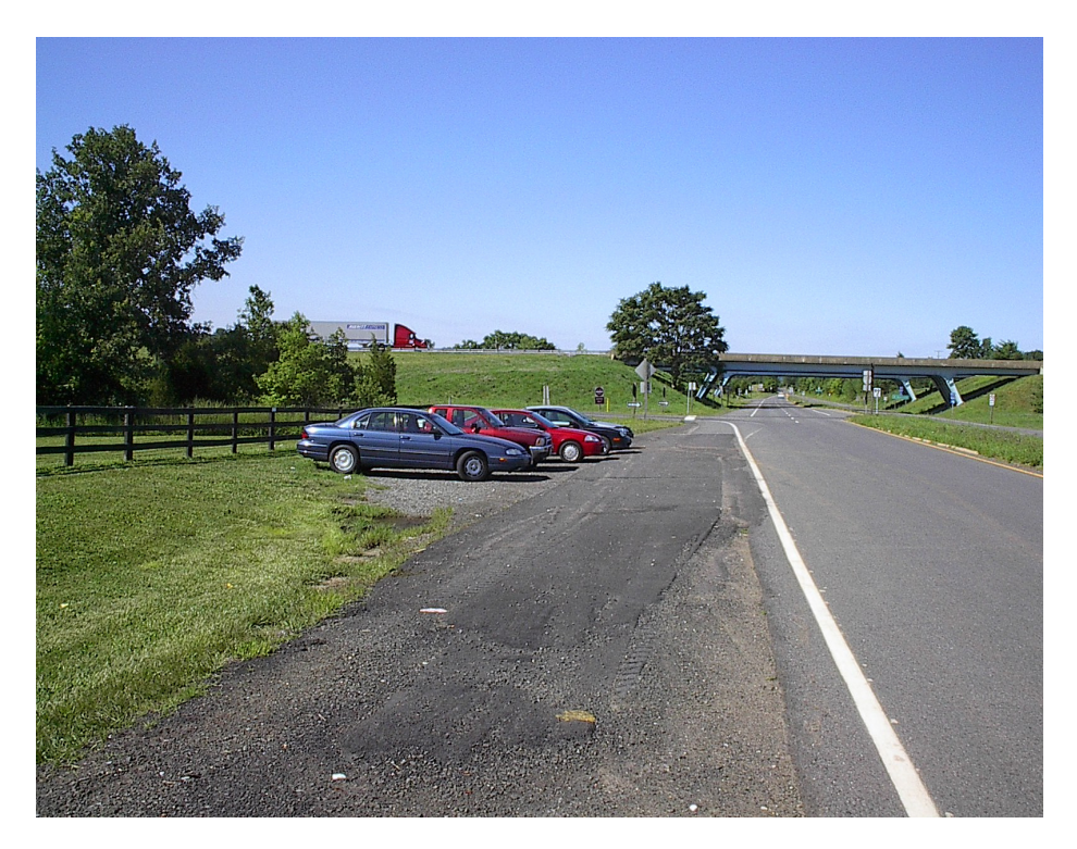
View – Northeast from Route 245

View – South along Route 245, I-66 in background